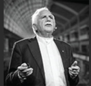
Moshe Safdie: Mr Safdie is an Israeli/Canadian/American architect, urban designer, educator, theorist, and author.