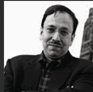
Sugato Bose: Mr Bose is a historian and Indian Member of Parliament and is a Gardiner Professor of Oceanic History and Affairs at Harvard University