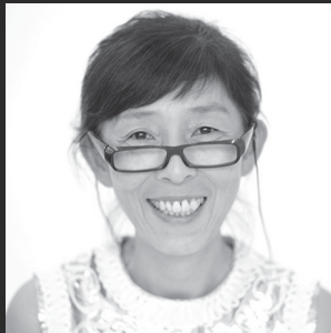
Kazuyo Sejima: Ms Sejima is a Japanese architect and prolific designer who co-founded the Tokyo-based firm SANAA