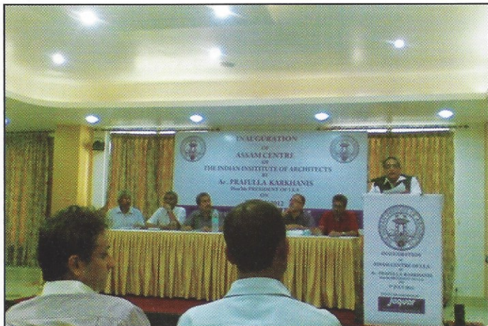
IIA President's Speech