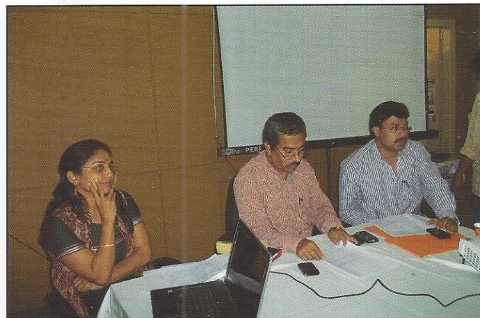
3rd GBM in Progress

The 3rd General body Meeting of the Chapter was held on 21.08.2012 at the Chapter Premises in presence of our Executive