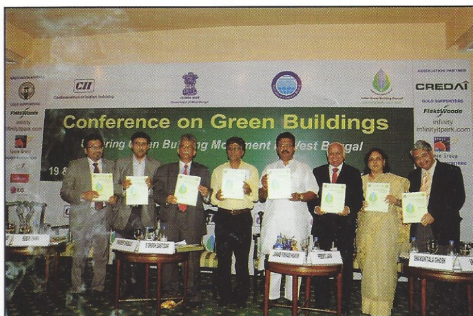
Hon'ble Minister and other dignitaries at the Conference

A Conference on Green Building 'Ushering a Green Building Movement into West Bengal' was organised by IGBC - CII in